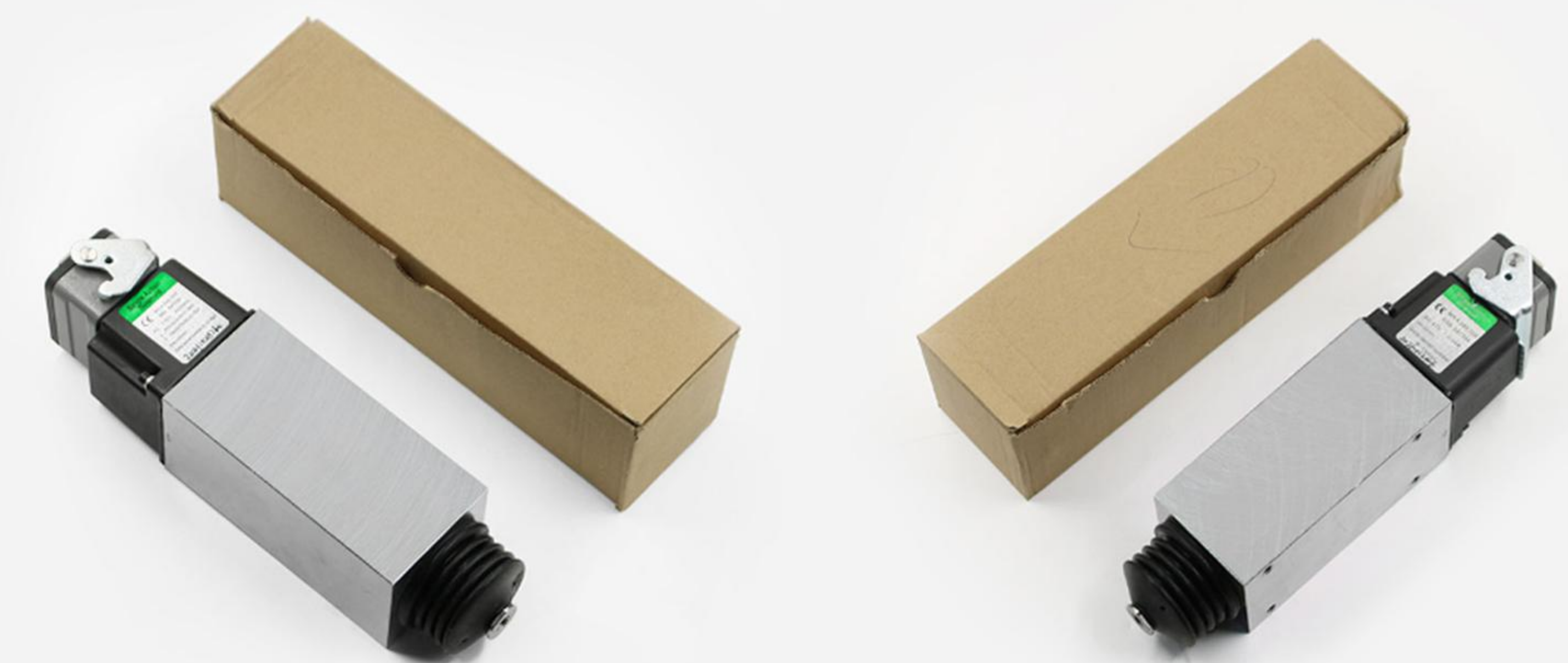
Corrugated outer box