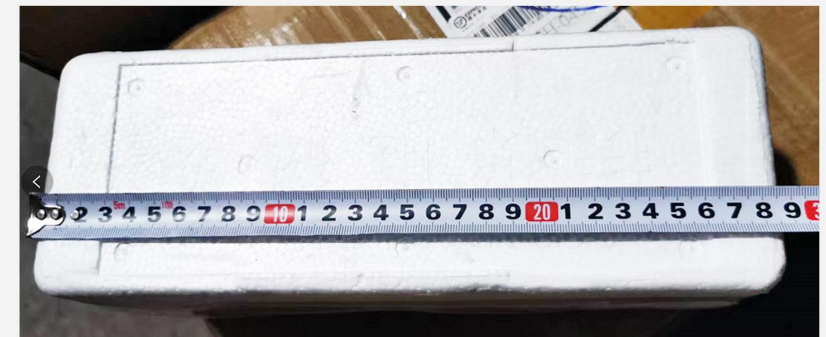
Foam inner box